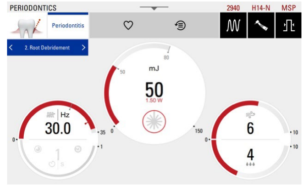
Figure 4: Settings used for subgingival plaque, granulations and calculus removal

For final decontamination and stabilization of the fibrin clot, the diode laser with 1064 nm wavelength, 4 W in continuous wave mode was applied again. The laser fiber tip was introduced into the periodontal pocket at a depth of 1 mm less than the value obtained through the probing procedure. The tip was held parallel to the long axis of the tooth, activated and kept in constant motion scanning the pocket wall until stable fibrin clot was achieved.