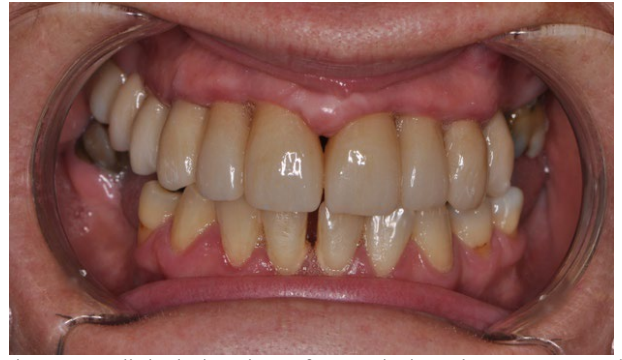
Figure 7: Clinical situation after periodontal treatment and new monolithic zirconia crowns