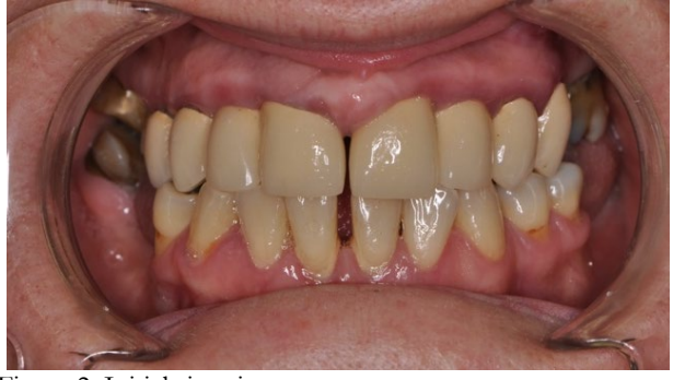
Figure 2: Initial situation