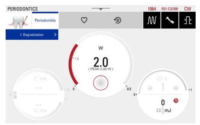
Figure 3: Settings used for periodontal pockets sterilization and decontamination