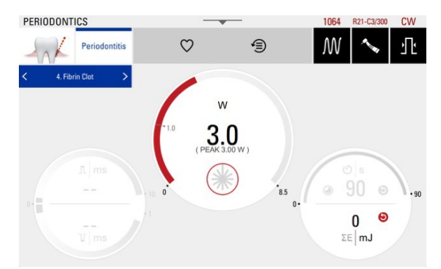
Figure 5: Settings used for final decontamination and stabilisation of the fibrin clot

For final decontamination and stabilization of the fibrin clot, the diode laser with 1064 nm wavelength, 4 W in continuous wave mode was applied again. The laser fiber tip was introduced into the periodontal pocket at a depth of 1 mm less than the value obtained through the probing procedure. The tip was held parallel to the long axis of the tooth, activated and kept in constant motion scanning the pocket wall until stable fibrin clot was achieved.